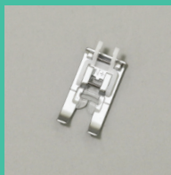
N+ MONOGRAMMING FOOT SA216