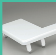
WIDE TABLE SAW T8